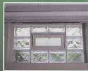
Glazed Block, Brick, Glass, PVC

*Not recommended for use on Polyethylene, Kynar, Nylon or in high alkalinity situations such as concrete. Follow label instructions for proper use.