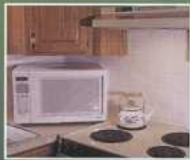
Ceramic Tile Indoors or Outdoors

CONFIDENCE Defined... No Peeling, Cracking, Blistering on Everyday Jobs